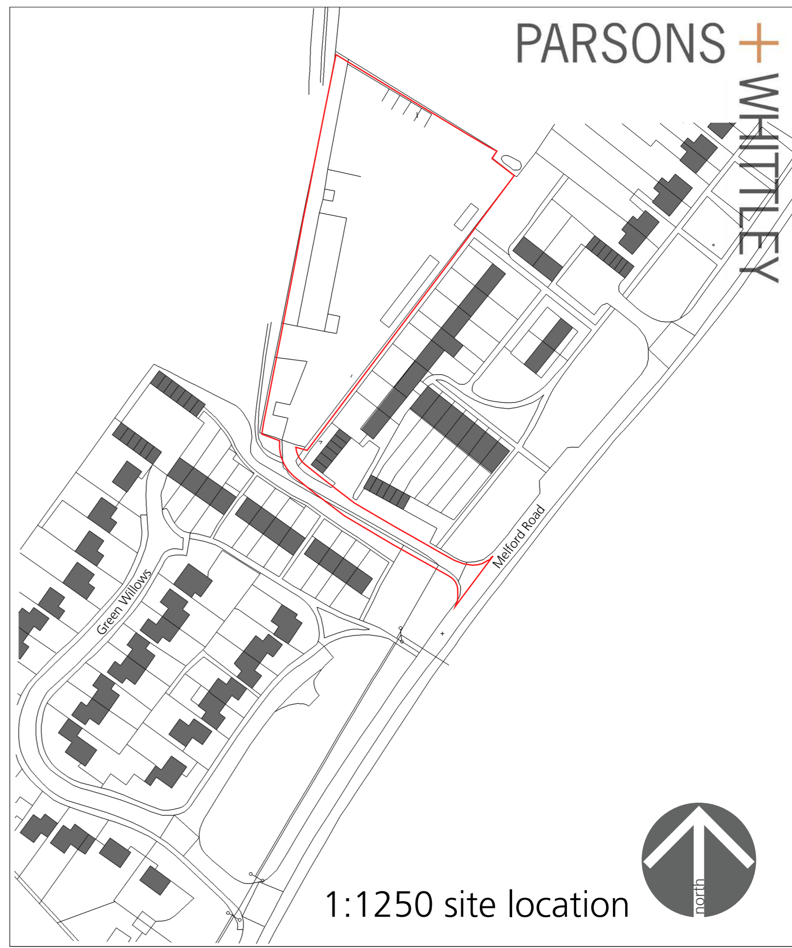
1:1250 site location