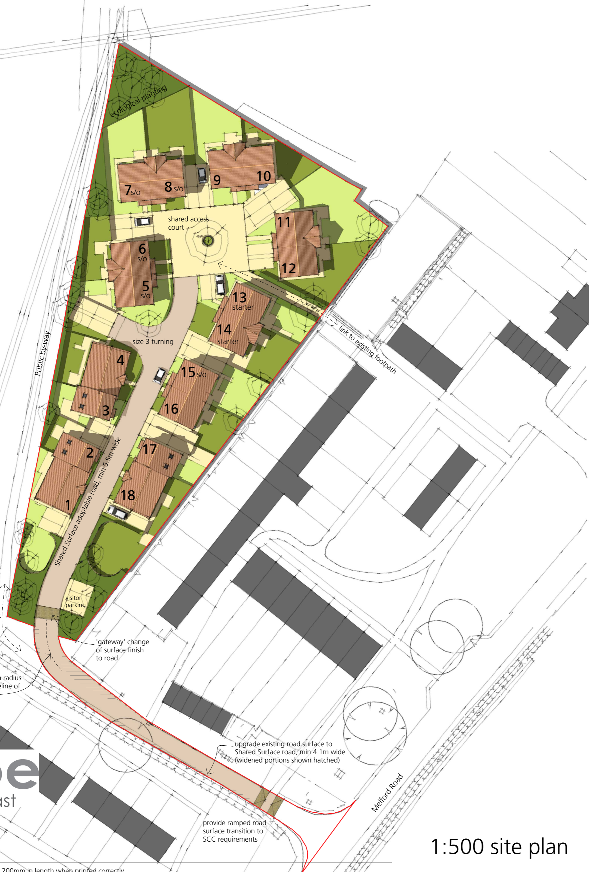
1:500 site plan

This line measures 200mm in length when printed correctly